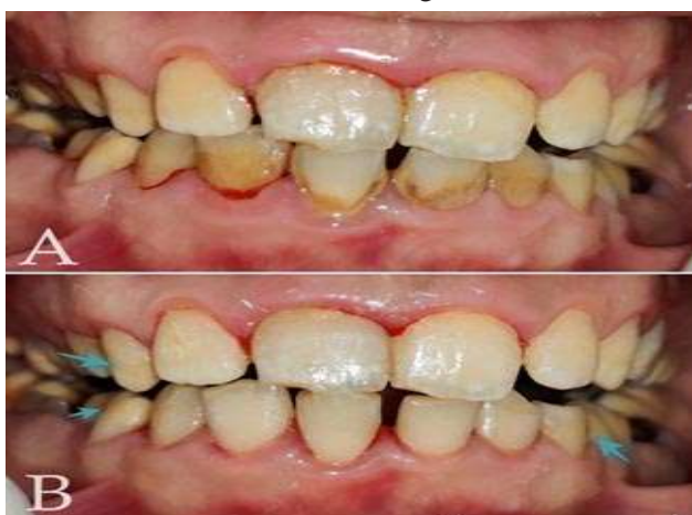
Figure 1: Intra oral picture of a thalassemia patient showing Pre (A) and post (B) scaling appearance. The blue arrows point at the characteristic yellow discoloration of the teeth

Due to regular transfusions, iron accumulation and surplus amounts of iron in systemic tissues of the thalassemia patients is well documented 11 . Iron deposits have also been found in the gingival tissues of TM- \beta patients 12 . Breakdown of haemoglobin leads to accumulation of bilirubin in the dentinal tubules of these patients leading to characteristic yellow discoloration of their teeth 13 [fig 1].