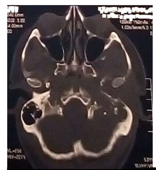
Fig. 1: Showing Sclerosis with Loss of Normal Air Lucencies Involving Left Mastoid Air Cells but Right Side Appears to be Normal

When the brain MRI with the scanning protocol of multiplanar multisequential images using usual protocols with contrast was carried out, redemonstration of abnormal signal intensity mass lesion was seen involving left temporal bone involving its petrous and squamous parts extending into mastoid air cells and showing complete obliteration of external auditory canal. It was appearing isointense on both T1W and T2W images showing significant postcontrast enhancement. The mass measured 6.3x5.0x4.0 cm (AP xTS x CC) T 4 size<sup>9</sup>. Medially, the mass was showing intracranial extension into the temporal lobe associated with perilesional edema. Posteromedially, the mass was seen infiltrating the temporal bone involving its petrous and squamous parts and it was extending into left cerebellopontine angle and abutting left cerebellar hemisphere. It was partially encasing petrous part of left internal carotid artery. Medially, it was partially infiltrating left pterygoid muscles and anteriorly it was reaching up to zygomatic arch.